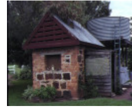
fulham balmoral horsham rd kanagulk meat house nov1980