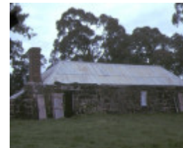
fulham balmoral horsham road kanagulk shearers shed nov1980