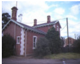
kangaroo flat railway station complex rear view jul1984