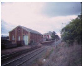
kangaroo flat railway station complex goods shed jul1984