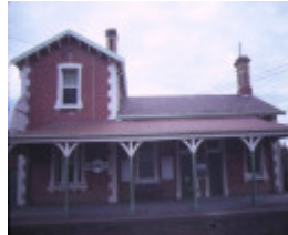
1 kangaroo flat railway station complex front elevation jul1984