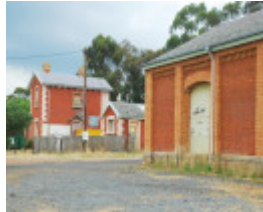
KANGAROO FLAT RAILWAY STATION COMPLEX SOHE 2008