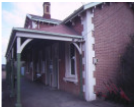
kangaroo flat railway station complex platform view jul1984