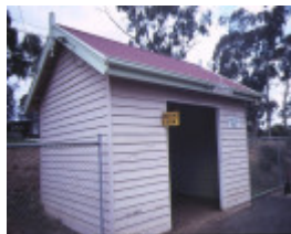
kangaroo flat railway station complex outbuilding jul1984