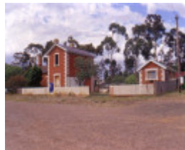
Kangaroo Flat Railway Station Complex Street Elevation