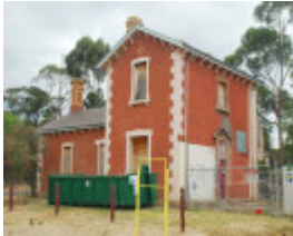
KANGAROO FLAT RAILWAY STATION COMPLEX SOHE 2008