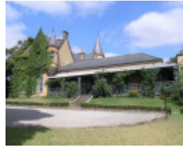
OVERNEWTON SOHE 2008