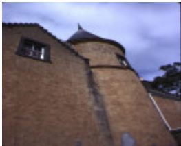
Overnewton Keilor Tower view