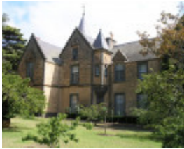
OVERNEWTON SOHE 2008