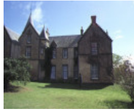
1 overnewton keilor front view