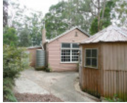
FORMER KERRIE PRIMARY SCHOOL NO.1290 SOHE 2008