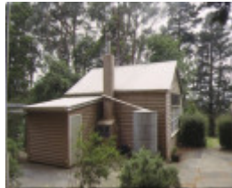
primary school number 1290 bolinda cherokee road kerrie rear elevation dec1998