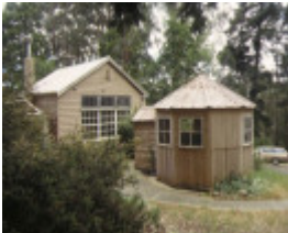
1 primary school number 1290 bolinda cherokee road kerrie property view dec1998