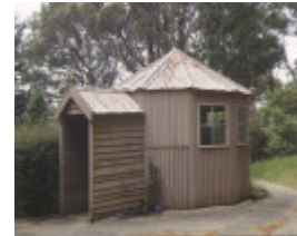
primary school number 1290 bolinda cherokee road kerrie shelter shed dec1998