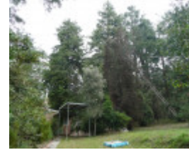
FORMER KERRIE PRIMARY SCHOOL NO.1290 SOHE 2008