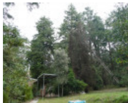
FORMER KERRIE PRIMARY SCHOOL NO.1290 SOHE 2008