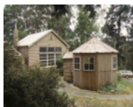
1 primary school number 1290 bolinda cherokee road kerrie property view dec1998