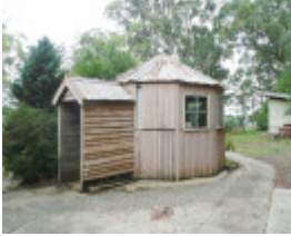
FORMER KERRIE PRIMARY SCHOOL NO.1290 SOHE 2008