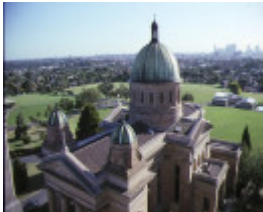
xavier college kew chapel aerial view