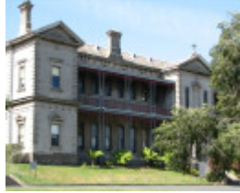
XAVIER COLLEGE SOHE 2008