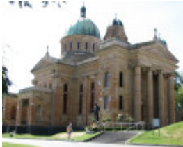
XAVIER COLLEGE SOHE 2008