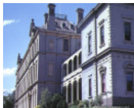
xavier college kew west wing front elevation