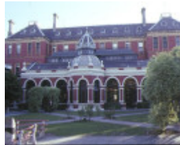
xavier college kew great hall front elevation may1990