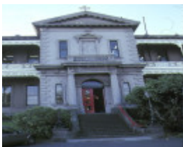
xavier college kew south wing entrance