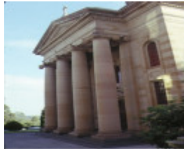
xavier college kew chapel entrance