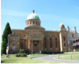
XAVIER COLLEGE SOHE 2008