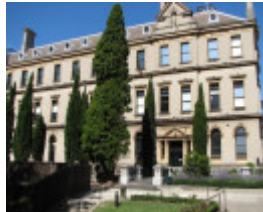
XAVIER COLLEGE SOHE 2008