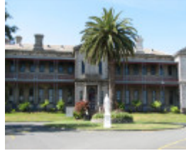
XAVIER COLLEGE SOHE 2008