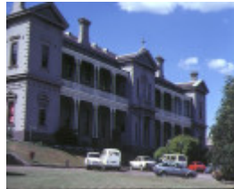
1 xavier college kew south wing front elevation