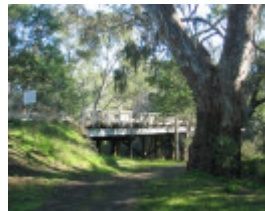
h00092 ol goulburn riv bridge seymour july 05 setting