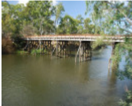
OLD GOULBURN RIVER BRIDGE SOHE 2008