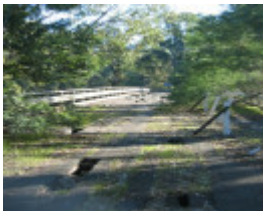
h00092 ol goulburn riv bridge seymour july 05 deck