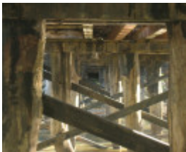
h00092 ol goulburn riv bridge seymour july 05 trestles