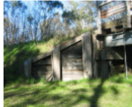
h00092 ol goulburn riv bridge seymour july 05 abutment