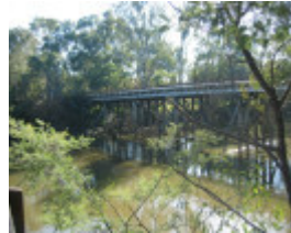
h00092 ol goulburn riv bridge seymour july 05