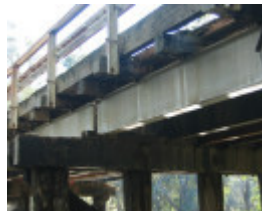
h00092 ol goulburn riv bridge seymour july 05 steel joists