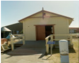
her2000 000160 fishermans shed front elevation sw april00