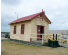
FISHERMAN'S SHED SOHE 2008