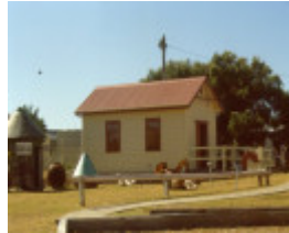
her2000 000160 fishermans shed exterior view sw april00