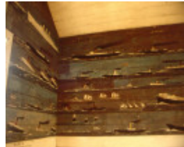
her2000 000160 fishermans shed interior detail sw april00