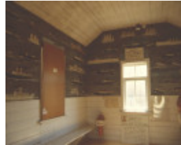
her2000 000160 1 fishermans shed interior view sw april00