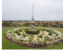
BLAIR MONA SOHE 2008