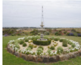
BLAIR MONA SOHE 2008