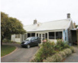
BLAIR MONA SOHE 2008