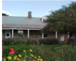
1 blairmona portland front pm1 may00