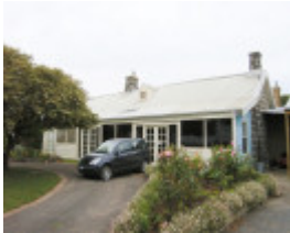
BLAIR MONA SOHE 2008