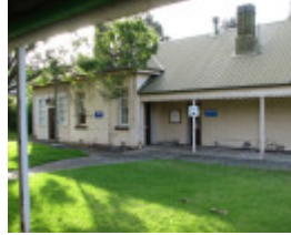
POLICE STATION AND FORMER COURT HOUSE SOHE 2008