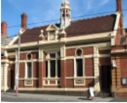
POLICE STATION AND FORMER COURT HOUSE SOHE 2008