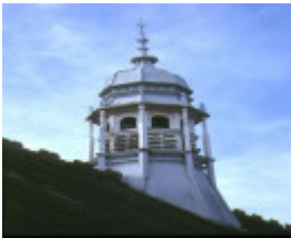
police station & former court house kew detail of tower