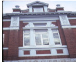
police station & former court house kew detail of front window