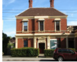
POLICE STATION AND FORMER COURT HOUSE SOHE 2008