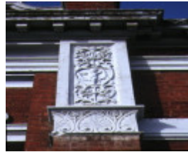
police station & former court house kew detail of attached pillar