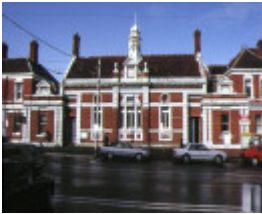
1 police station & former court house kew front view