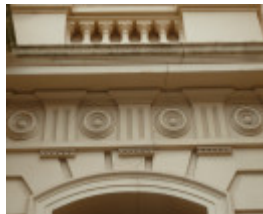
H0657 BALLARAT TRADES HALL LHA 2015 4.JPG