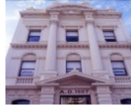
ballarat trades hall camp street ballarat close up she project 2003