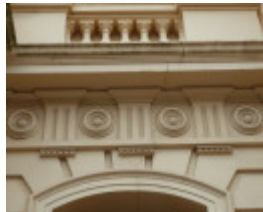
H0657 BALLARAT TRADES HALL LHA 2015 4.JPG