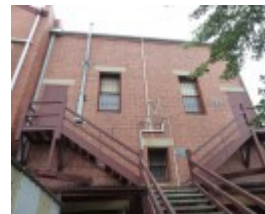
H0657 BALLARAT TRADES HALL LHA 2015 5.JPG