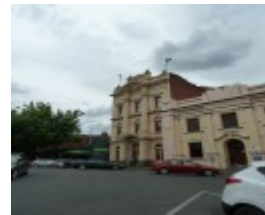
H0657 BALLARAT TRADES HALL LHA 2015 2.JPG