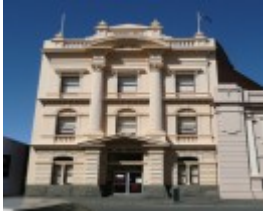
BALLARAT TRADES HALL SOHE 2008