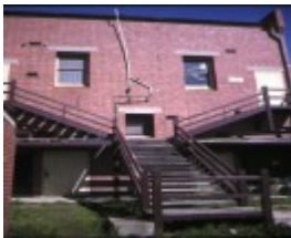
ballarat trades hall rear view