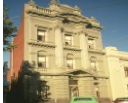
1 ballarat trades hall camp street ballarat front elevation