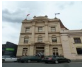
H0657 BALLARAT TRADES HALL LHA 2015 1.JPG