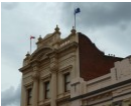
H0657 BALLARAT TRADES HALL LHA 2015 3.JPG