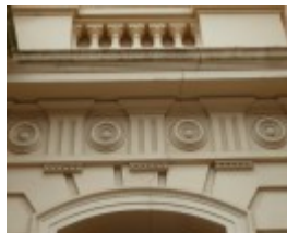
H0657 BALLARAT TRADES HALL LHA 2015 4.JPG