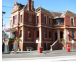
FORMER KEW POST OFFICE SOHE 2008