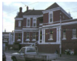
former kew post office cotham road view