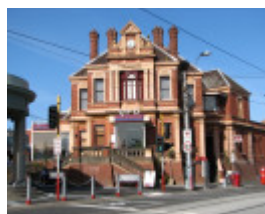
FORMER KEW POST OFFICE SOHE 2008