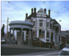
1 former kew post office front view