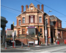
FORMER KEW POST OFFICE SOHE 2008