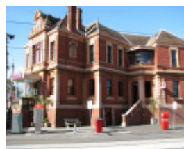
FORMER KEW POST OFFICE SOHE 2008