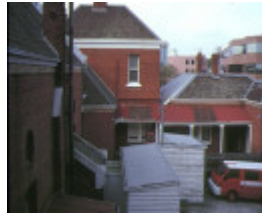
former kew post office rear view