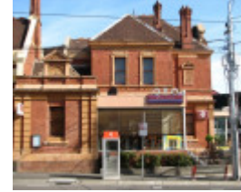
FORMER KEW POST OFFICE SOHE 2008