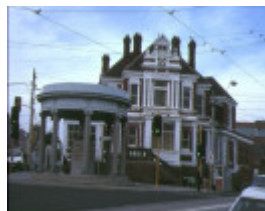
1 former kew post office front view