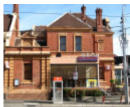
FORMER KEW POST OFFICE SOHE 2008