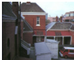
former kew post office rear view