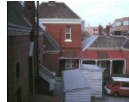
former kew post office rear view