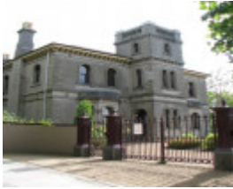
VILLA ALBA SOHE 2008