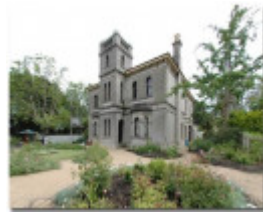
H0605 Villa Alba garden