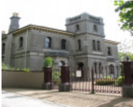
VILLA ALBA SOHE 2008