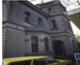
villa alba walmer street kew front view jun1984