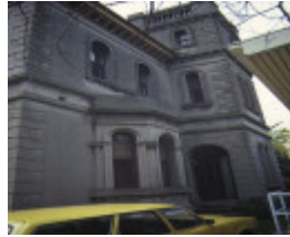
villa alba walmer street kew front view jun1984