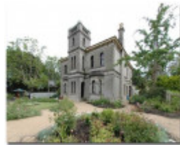
H0605 Villa Alba garden