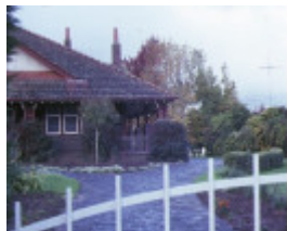
1 banool fitzroy street kilmore front view may1980