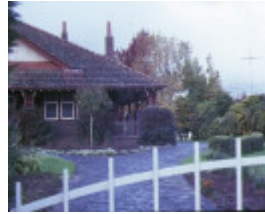
1 banool fitzroy street kilmore front view may1980