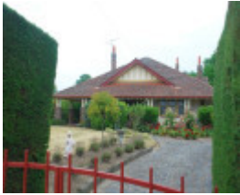
BANOOL SOHE 2008