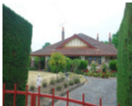
BANOOL SOHE 2008