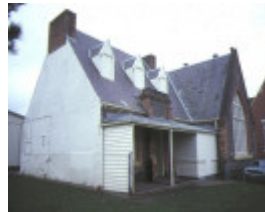
primary school no 33 ballarat side view aug1984