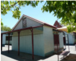
PRIMARY SCHOOL NO.33 SOHE 2008