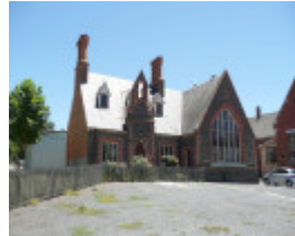
PRIMARY SCHOOL NO.33 SOHE 2008