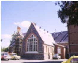
primary school no 33 ballarat hall view mar1998