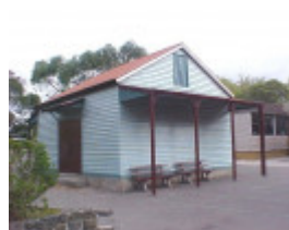
h01714 primary school no 33 dana street ballarat shelter shed