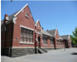
PRIMARY SCHOOL NO.33 SOHE 2008