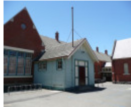
PRIMARY SCHOOL NO.33 SOHE 2008