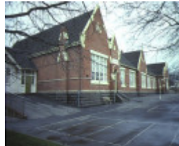
1 primary school no 33 ballarat front elevation aug1984