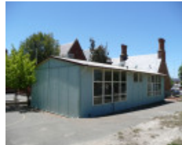
PRIMARY SCHOOL NO.33 SOHE 2008