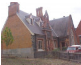
h01714 primary school no 33 dana street ballarat residence