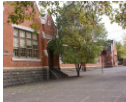
h01714 primary school no 33 dana street ballarat playground