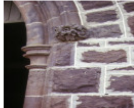
st patricks church sutherland street kilmore entrance archway detail may1989