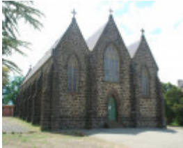
ST PATRICKS CHURCH SOHE 2008