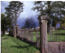
st patricks sutherland street kilmore surrounding fence may1989