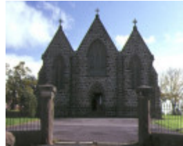
1 st patricks sutherland street kilmore front view may1989