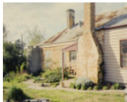
the towers victoria parade kilmore rear view cottage