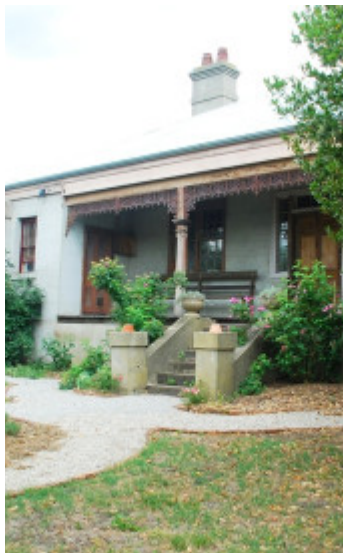
THE TOWERS SOHE 2008