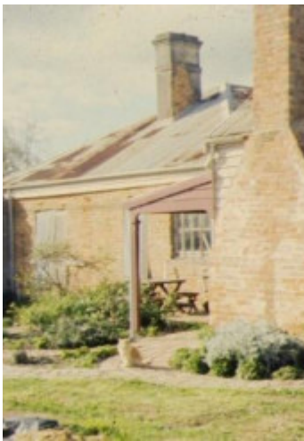
the towers victoria parade kilmore rear view cottage