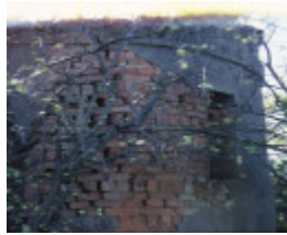
the towers victoria parade kilmore right hand tower may1983