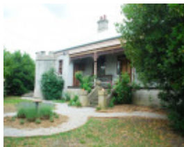
THE TOWERS SOHE 2008