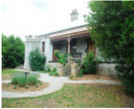
THE TOWERS SOHE 2008