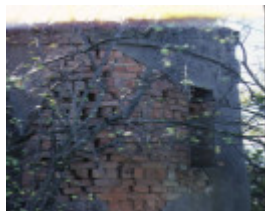
the towers victoria parade kilmore right hand tower may1983