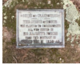
World War Two Memorial Plaque South Gippsland Highway