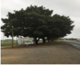
World War Two Memorial Planting South Gippsland Highway