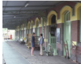
korumburra railway station complex station street korumburra platform view may1984