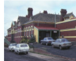
korumburra railway station complex station street korumburra front view may1984