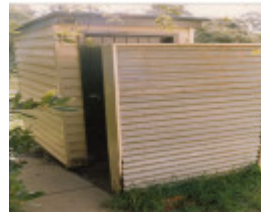
Teachers Residence at State School 1134 Colour 4 - Shire of Eltham Heritage Study 1992