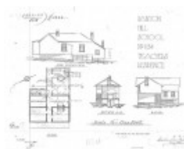
163 - Teachers Residence at State School 1134 08 - Shire of Eltham Heritage Study 1992