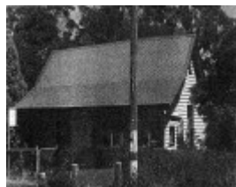
163 - Teachers Residence at State School 1134 - Shire of Eltham Heritage Study 1992