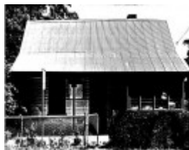
163 - Teachers Residence at State School 1134 02 - Shire of Eltham Heritage Study 1992