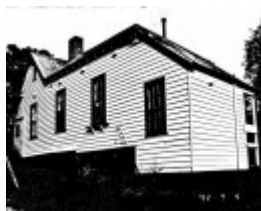
163 - Teachers Residence at State School 1134 03 - Shire of Eltham Heritage Study 1992