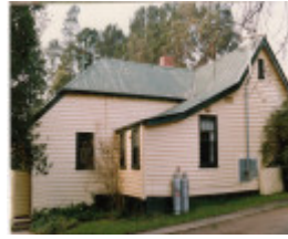
Teachers Residence at State School 1134 Colour 3 - Shire of Eltham Heritage Study 1992