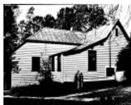
163 - Teachers Residence at State School 1134 04 - Shire of Eltham Heritage Study 1992