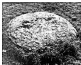
163 - Teachers Residence at State School 1134 05 - Shire of Eltham Heritage Study 1992