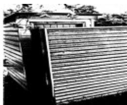
163 - Teachers Residence at State School 1134 06 - Shire of Eltham Heritage Study 1992