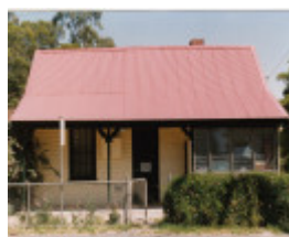
Teachers Residence at State School 1134 Colour 1 - Shire of Eltham Heritage Study 1992