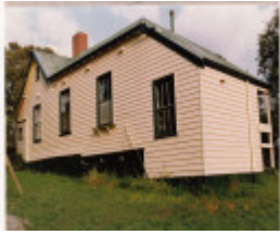
Teachers Residence at State School 1134 Colour 2 - Shire of Eltham Heritage Study 1992