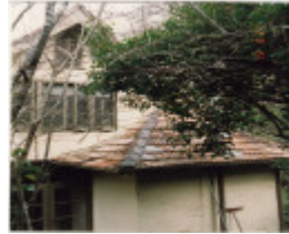
Penleigh Boyd House North Warrandyte Colour 5 - Shire of Eltham Heritage Study 1992