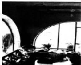
170 - Penleigh Boyd House North Warrandyte 08 - Shire of Eltham Heritage Study 1992