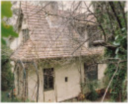
Penleigh Boyd House North Warrandyte Colour 3 - Shire of Eltham Heritage Study 1992