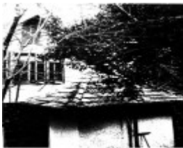
170 - Penleigh Boyd House North Warrandyte 07 - Shire of Eltham Heritage Study 1992