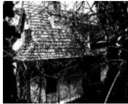
170 - Penleigh Boyd House North Warrandyte 05 - Shire of Eltham Heritage Study 1992