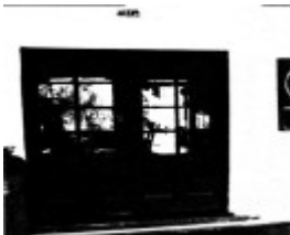
170 - Penleigh Boyd House North Warrandyte 10 - Shire of Eltham Heritage Study 1992