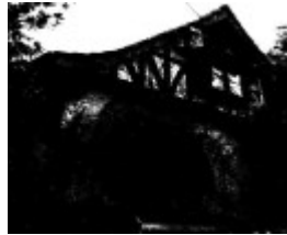
170 - Penleigh Boyd House North Warrandyte 06 - Shire of Eltham Heritage Study 1992