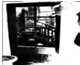
170 - Penleigh Boyd House North Warrandyte 09 - Shire of Eltham Heritage Study 1992