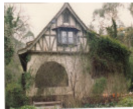
Penleigh Boyd House North Warrandyte Colour 1 - Shire of Eltham Heritage Study 1992