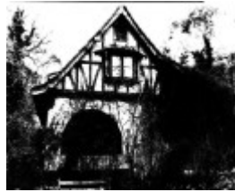
170 - Penleigh Boyd House North Warrandyte 03 - Shire of Eltham Heritage Study 1992