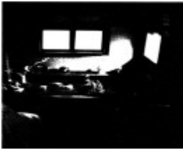
170 - Penleigh Boyd House North Warrandyte 19 - Shire of Eltham Heritage Study 1992