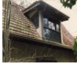
Penleigh Boyd House North Warrandyte Colour 8 - Shire of Eltham Heritage Study 1992