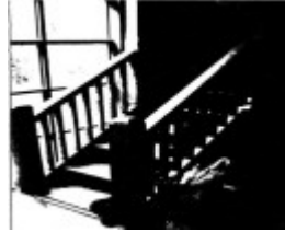
170 - Penleigh Boyd House North Warrandyte 18 - Shire of Eltham Heritage Study 1992