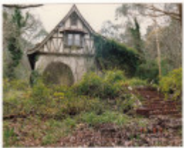
Penleigh Boyd House North Warrandyte Colour 11 - Shire of Eltham Heritage Study 1992