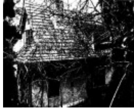
170 - Penleigh Boyd House North Warrandyte 05 - Shire of Eltham Heritage Study 1992