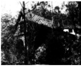
170 - Penleigh Boyd House North Warrandyte 04 - Shire of Eltham Heritage Study 1992