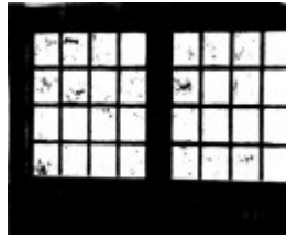
170 - Penleigh Boyd House North Warrandyte 21 - Shire of Eltham Heritage Study 1992