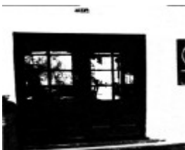
170 - Penleigh Boyd House North Warrandyte 10 - Shire of Eltham Heritage Study 1992