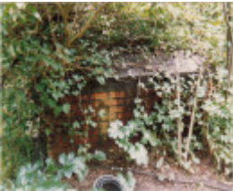
Penleigh Boyd House North Warrandyte Colour 9 - Shire of Eltham Heritage Study 1992