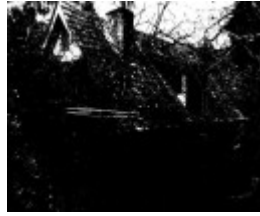
170 - Penleigh Boyd House North Warrandyte 15 - Shire of Eltham Heritage Study 1992