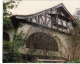
Penleigh Boyd House North Warrandyte Colour 4 - Shire of Eltham Heritage Study 1992