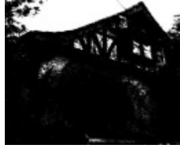
170 - Penleigh Boyd House North Warrandyte 06 - Shire of Eltham Heritage Study 1992