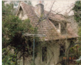
Penleigh Boyd House North Warrandyte Colour 7 - Shire of Eltham Heritage Study 1992