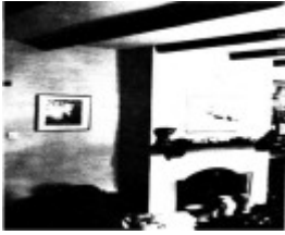
170 - Penleigh Boyd House North Warrandyte 13 - Shire of Eltham Heritage Study 1992