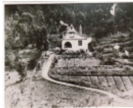
Penleigh Boyd House North Warrandyte Black & White 1 - Shire of Eltham Heritage Study 1992