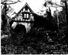
170 - Penleigh Boyd House North Warrandyte - Shire of Eltham Heritage Study 1992