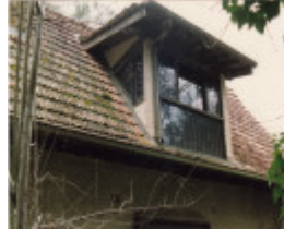
Penleigh Boyd House North Warrandyte Colour 8 - Shire of Eltham Heritage Study 1992