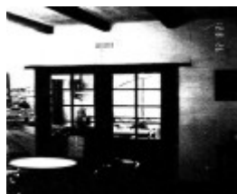
170 - Penleigh Boyd House North Warrandyte 12 - Shire of Eltham Heritage Study 1992