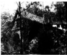
170 - Penleigh Boyd House North Warrandyte 04 - Shire of Eltham Heritage Study 1992