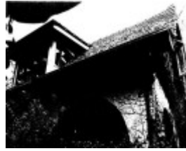
170 - Penleigh Boyd House North Warrandyte 14 - Shire of Eltham Heritage Study 1992