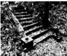
170 - Penleigh Boyd House North Warrandyte 22 - Shire of Eltham Heritage Study 1992