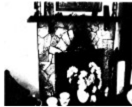
170 - Penleigh Boyd House North Warrandyte 20 - Shire of Eltham Heritage Study 1992