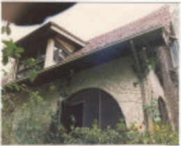
Penleigh Boyd House North Warrandyte Colour 6 - Shire of Eltham Heritage Study 1992