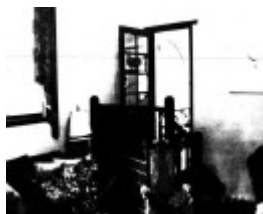
170 - Penleigh Boyd House North Warrandyte 11 - Shire of Eltham Heritage Study 1992