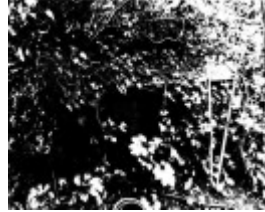
170 - Penleigh Boyd House North Warrandyte 17 - Shire of Eltham Heritage Study 1992