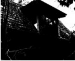
170 - Penleigh Boyd House North Warrandyte 16 - Shire of Eltham Heritage Study 1992