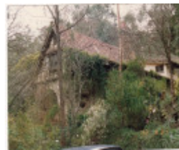
Penleigh Boyd House North Warrandyte Colour 2 - Shire of Eltham Heritage Study 1992