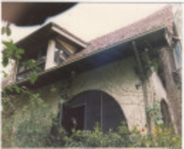
Penleigh Boyd House North Warrandyte Colour 6 - Shire of Eltham Heritage Study 1992