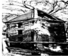
176 - Knox Last House Office 2 King St 03 - Shire of Eltham Heritage Study 1992