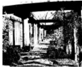
176 - Knox Last House Office 2 King St 02 - Shire of Eltham Heritage Study 1992