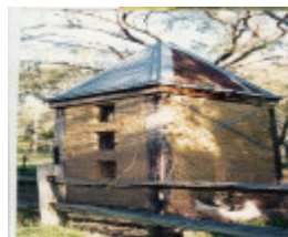
Knox Last House Office 2 King St Colour 2 - Shire of Eltham Heritage Study 1992