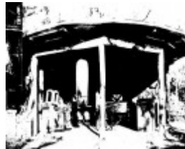
176 - Knox Last House Office 2 King St 05 - Shire of Eltham Heritage Study 1992