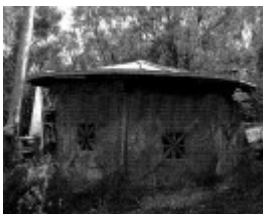
ALISTAIR KNOX'S HOUSE AND OFFICE - Pottery Studio - Shire of Nillumbik Study, 2000