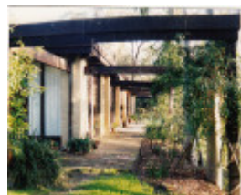
Knox Last House Office 2 King St Colour 1 - Shire of Eltham Heritage Study 1992