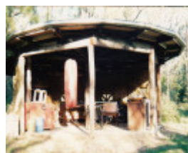
Knox Last House Office 2 King St Colour 4 - Shire of Eltham Heritage Study 1992