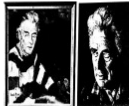
176 - Knox Last House Office 2 King St 06 - Shire of Eltham Heritage Study 1992