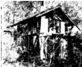
176 - Knox Last House Office 2 King St 04 - Shire of Eltham Heritage Study 1992