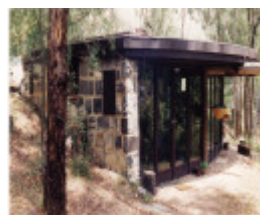
Knox Last House Office 2 King St Colour 5 - Shire of Eltham Heritage Study 1992