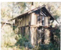
Knox Last House Office 2 King St Colour 3 - Shire of Eltham Heritage Study 1992