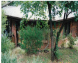
Former Lim Joon House 618 Main Rd Eltham Colour 1 - Shire of Eltham Heritage Study 1992