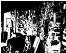
189 - Former Lim Joon House 618 Main Rd Eltham 06 - Shire of Eltham Heritage Study 1992