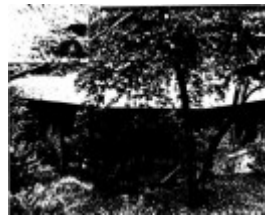
189 - Former Lim Joon House 618 Main Rd Eltham 04 - Shire of Eltham Heritage Study 1992