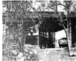
189 - Former Lim Joon House 618 Main Rd Eltham - Shire of Eltham Heritage Study 1992