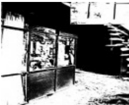
189 - Former Lim Joon House 618 Main Rd Eltham 03 - Shire of Eltham Heritage Study 1992