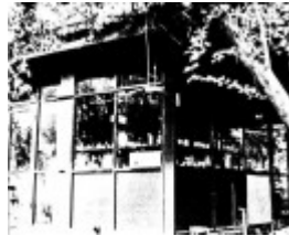
189 - Former Lim Joon House 618 Main Rd Eltham 02 - Shire of Eltham Heritage Study 1992