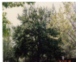
Plane Tree Ave of Honour Main Rd Eltham Colour 3 - Shire of Eltham Heritage Study 1992