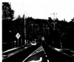
196 - Plane Tree Ave of Honour Main Rd Eltham 03 - Shire of Eltham Heritage Study 1992