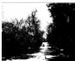
196 - Plane Tree Ave of Honour Main Rd Eltham 02 - Shire of Eltham Heritage Study 1992