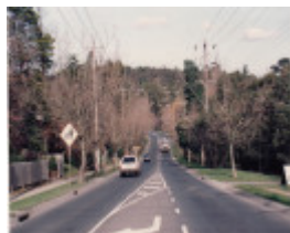
Plane Tree Ave of Honour Main Rd Eltham Colour 2 - Shire of Eltham Heritage Study 1992