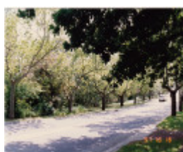
Plane Tree Ave of Honour Main Rd Eltham Colour 4 - Shire of Eltham Heritage Study 1992