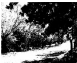
196 - Plane Tree Ave of Honour Main Rd Eltham - Shire of Eltham Heritage Study 1992