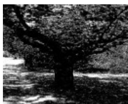
London plane tree avenue of honour- Nillumbik Shire Heritage Study 2001