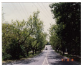
Plane Tree Ave of Honour Main Rd Eltham Colour 1 - Shire of Eltham Heritage Study 1992