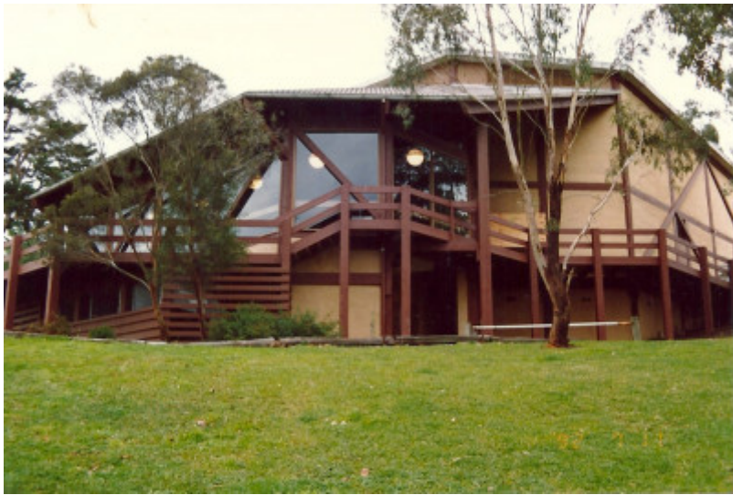
Eltham Community Centre Main Rd Eltham Colour 3 - Shire of Eltham Heritage Study 1992