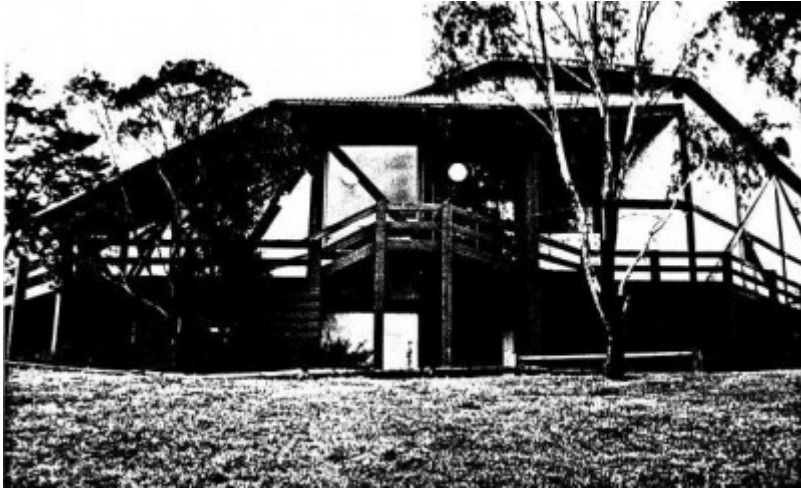
203 - Eltham Community Centre Main Rd Eltham 03 - Shire of Eltham Heritage Study 1992