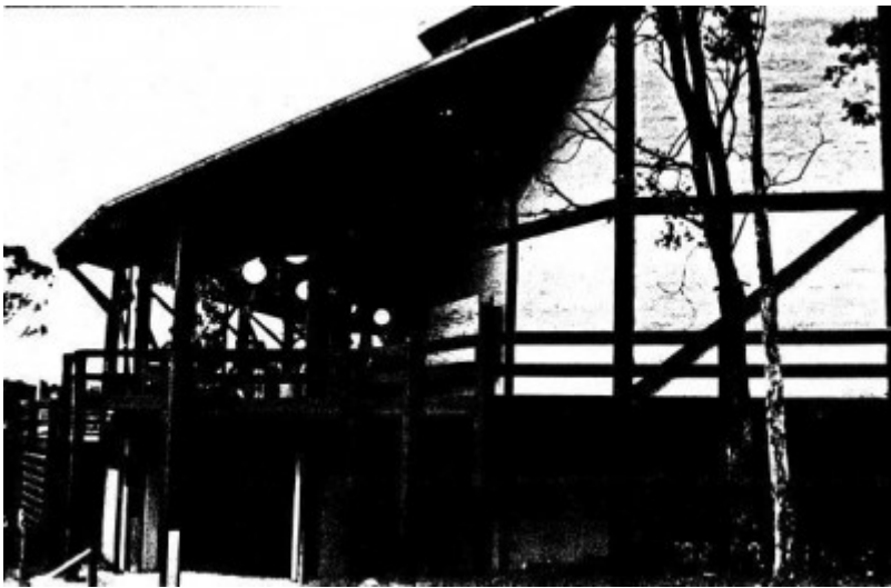
203 - Eltham Community Centre Main Rd Eltham 04 - Shire of Eltham Heritage Study 1992