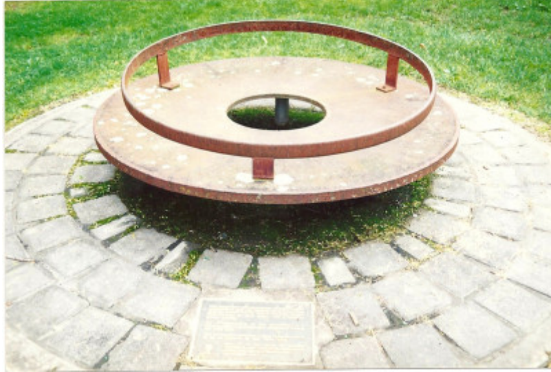
Eltham Community Centre Main Rd Eltham Colour 5 - Shire of Eltham Heritage Study 1992