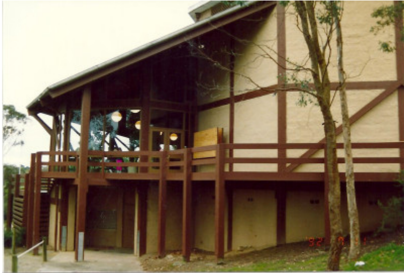
Eltham Community Centre Main Rd Eltham Colour 2 - Shire of Eltham Heritage Study 1992