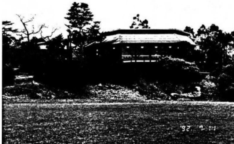
203 - Eltham Community Centre Main Rd Eltham 02 - Shire of Eltham Heritage Study 1992