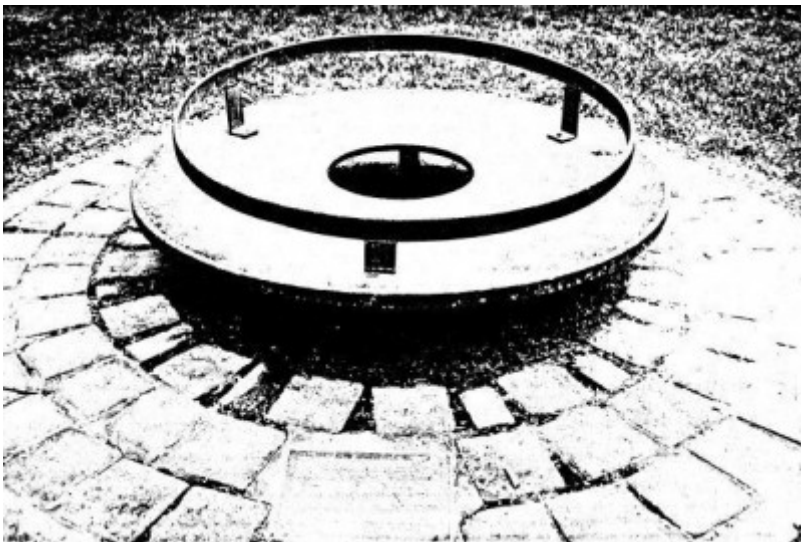
203 - Eltham Community Centre Main Rd Eltham 05 - Shire of Eltham Heritage Study 1992