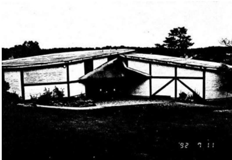
203 - Eltham Community Centre Main Rd Eltham - The Blacksmith's shop which was in main road opposite Pitt Street - Blacksmith Sid Brown is to the right (ELHPC NO.753) - Shire of Eltham Heritage Study 1992