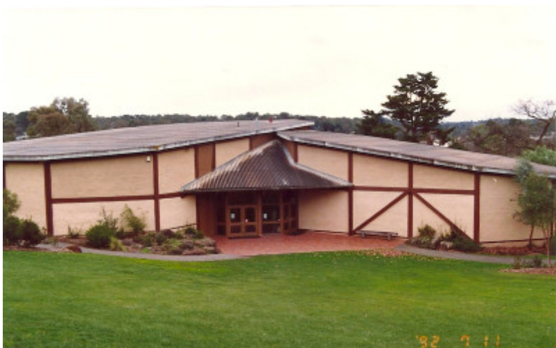
Eltham Community Centre Main Rd Eltham Colour 1 - Shire of Eltham Heritage Study 1992