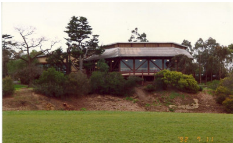
Eltham Community Centre Main Rd Eltham Colour 4 - Shire of Eltham Heritage Study 1992