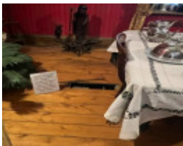
2023. Subfloor bank vault locking mechanism in dining room of the first floor, connects to the bank vault below.