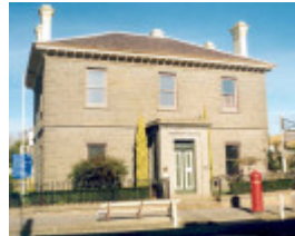
H00308 1 former bank of nsw piper street kyneton front view