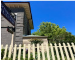
2023. 1905 'lean to' addition occupies the footprint of original conservatory.