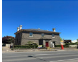
2023. Primary facade of Bank of NSW to Piper Street.