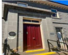
2023. Piper street entrance