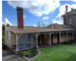
2023. Washhouse, kitchen and southern elevation of bank building.