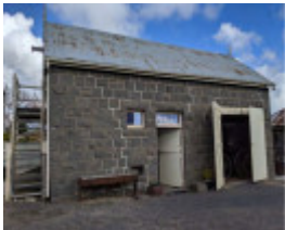
2023. Stables building to southern end of site.