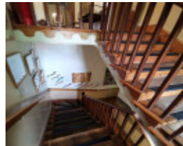
2023. Original timber staircase.