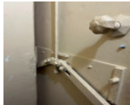
2023. Bank vault locking mechanism to ground floor.