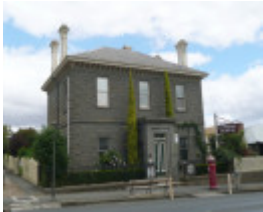
2008. SOHE Piper Street Elevation