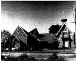
St John's Church of England