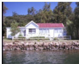
H1532 new works lakes entrance house lot 18