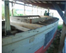
NEW WORKS HISTORIC COMPLEX SOHE 2008