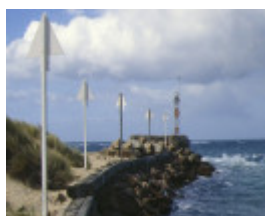
new works lakes entrance view of barrier