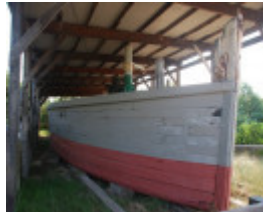
NEW WORKS HISTORIC COMPLEX SOHE 2008