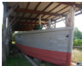
NEW WORKS HISTORIC COMPLEX SOHE 2008