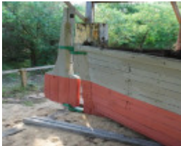
NEW WORKS HISTORIC COMPLEX SOHE 2008