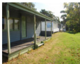
NEW WORKS HISTORIC COMPLEX SOHE 2008