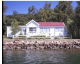
H1532 new works lakes entrance house lot 18