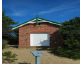
NEW WORKS HISTORIC COMPLEX SOHE 2008