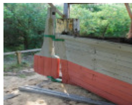
NEW WORKS HISTORIC COMPLEX SOHE 2008