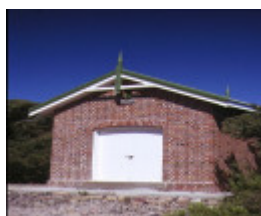
new works lakes entrance rocket shed