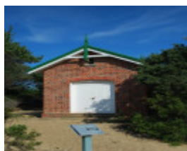
NEW WORKS HISTORIC COMPLEX SOHE 2008