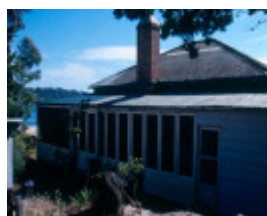
New Works Historic Complex Lakes Entrance Breezy 2006