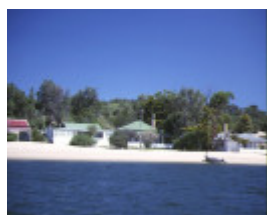
new works lakes entrance view of houses