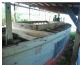
NEW WORKS HISTORIC COMPLEX SOHE 2008