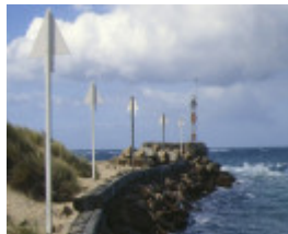
new works lakes entrance view of barrier