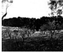
Apple orchard & Monterey pine rows