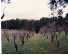
Apple Orchard and Monterey Pine Rows Colour