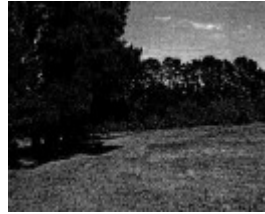
Apple Orchard and Monterey Pine Rows