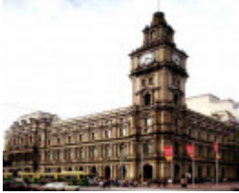
B0445 Melbourne GPO