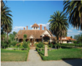
KARLSRUHE SOHE 2008