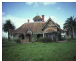
karlsruhe lancaster front view