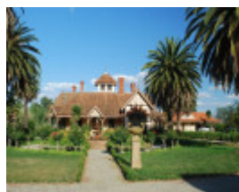
KARLSRUHE SOHE 2008