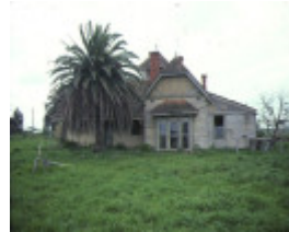
karlsruhe lancaster side view sep1983