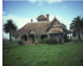
karlsruhe lancaster front view