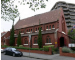
B6155 East Melbourne Holy Trinity