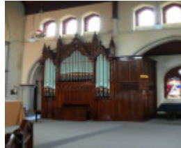
B6155 Henry M Boom Pipe Organ