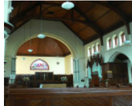
B6155 Henry M Boom Pipe Organ