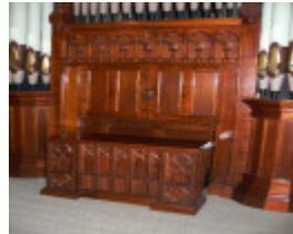
B6155 Henry M Bloom Pipe Organ