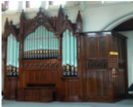
B6155 Henry M Boom Pipe Organ