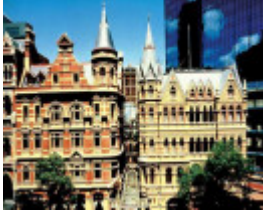
B2894 Rialto Building (on right)