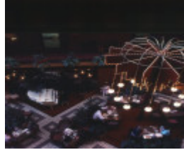
B2894 Rialto Building Laneway