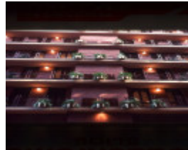
B2894 Rialto Building Laneway