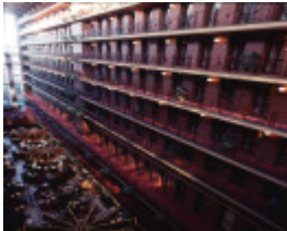
B2894 Rialto Building Laneway