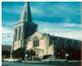
B5960 St Mark's Camberwell