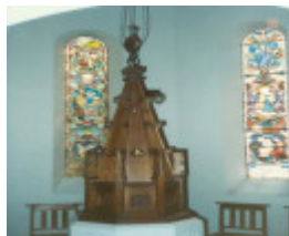
B5960 St Mark's Camberwell