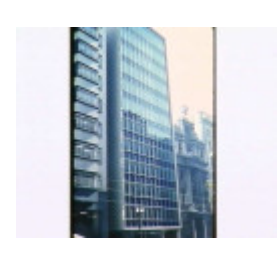
B6569 Original facade Alliance Building