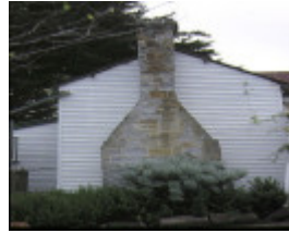
former wattle hill hotel lavers hill side view & chimney april 1994