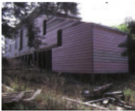
former wattle hill hotel lavers hill rear view april 1987