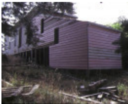
former wattle hill hotel lavers hill rear view april 1987