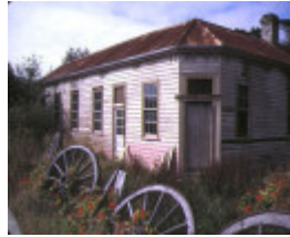
former wattle hill hotel lavers hill front corner april 1987