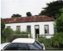
1 former wattle hill hotel lavers hill front view april 1994