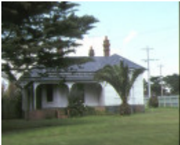
st marks on the hill leopold vicarage