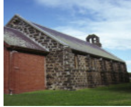
st marks on the hill leopold rear view