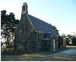
ST MARKS ON THE HILL SOHE 2008