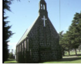
1 st marks on the hill leopold front view