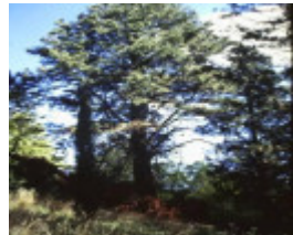
T11526 Pinus ponderosa