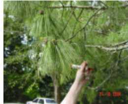
T11525 Pinus wallichiana