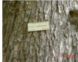
T11525 Pinus wallichiana