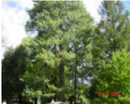
T11526 Pinus ponderosa