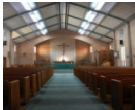
B2571 Svensson Pipe Organ