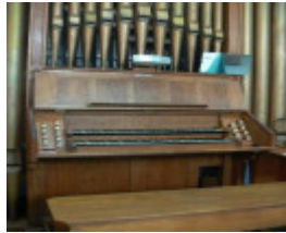
B2571 Svensson Pipe Organ