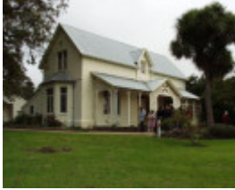
B1403 Ballam Park