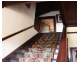
B1403 Ballam Park