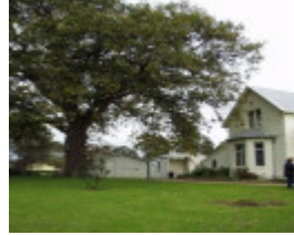
B1403 Ballam Park