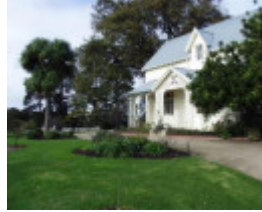
B1403 Ballam Park