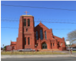
B6028 St Aloysius Church