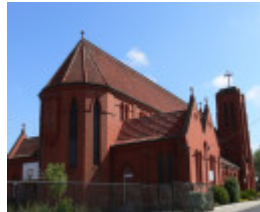
B6028 St Aloysius Church