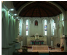
B6028 St Aloysius Church & Organ