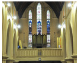
B6028 St Aloysius Church & Organ