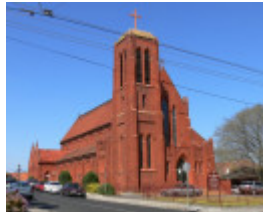
B6028 St Aloysius Church