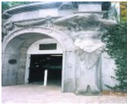
B6479 Underground Carpark