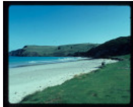
CAPE BRIDGEWATER ROAD, GREAT SOUTH WEST WALK, CAPE BRIDGEWATER