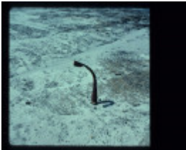
CAPE BRIDGEWATER ROAD, GREAT SOUTH WEST WALK, CAPE BRIDGEWATER FEATURE