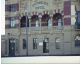
provincial hotel ballarat detail balcony feb1990