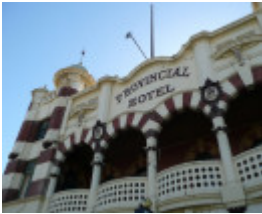
THE PROVINCIAL HOTEL SOHE 2008