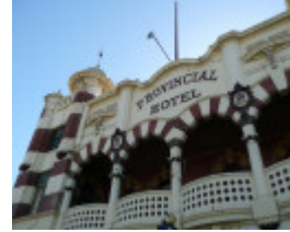
THE PROVINCIAL HOTEL SOHE 2008