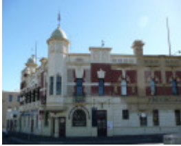
THE PROVINCIAL HOTEL SOHE 2008