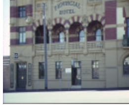
provincial hotel ballarat detail balcony feb1990