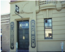
provincial hotel ballarat entrance