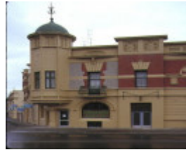
provincial hotel ballarat view tower sep1989