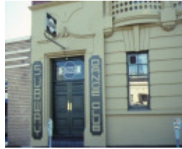
provincial hotel ballarat entrance