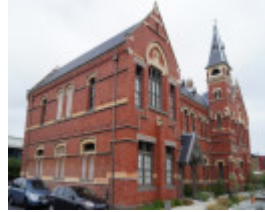
B5748 Former State School