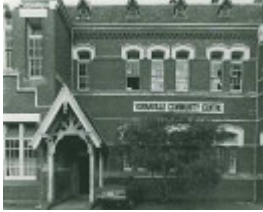
B5748 Former State School