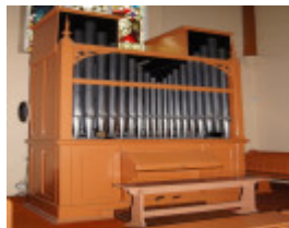
B6011 St Monica's Organ