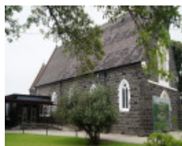
B6011 St Monica's Church