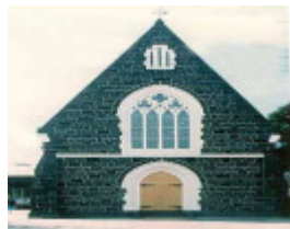
B6011 St Monica's Church