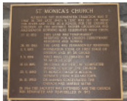
B6011 St Monica's Church