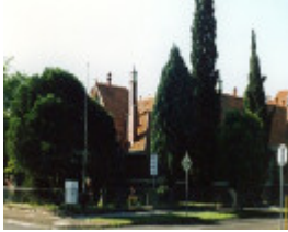
B5940 Former Essendon High School