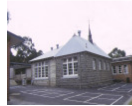
1 primary school no 2162 grove road lorne yard view mar1998