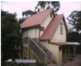
primary school no 2162 grove road lorne residence mar1998