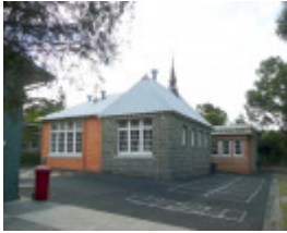
PRIMARY SCHOOL NO.2162 SOHE 2008