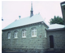
primary school no 2162 grove road lorne side elevation jul1984