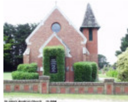
B6958 St. John's Anglican Church