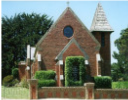
B6958 St John's Anglican Church