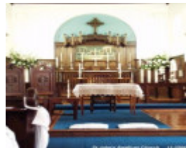
B6959 St. John's Anglican Church