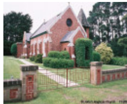
B6958 St. John's Anglican Church