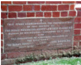
B6958 St. John's Anglican Church