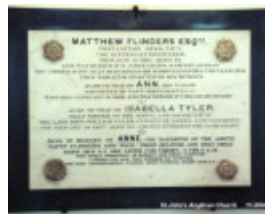
B6958 St. John's Anglican Church