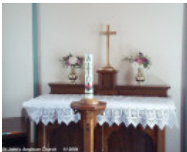
B6958 St. John's Anglican Church