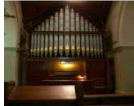
B6958 St John's Anglican Church