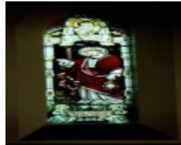
B1244 St Peter's Anglican Church