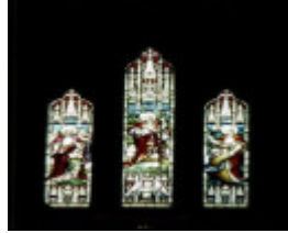
B1244 St Peter's Anglican Church