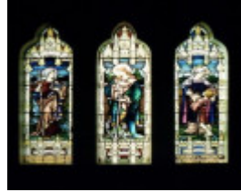
B1244 St Peter's Anglican Church