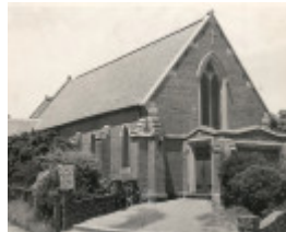
B1244 St Peter's Anglican Church