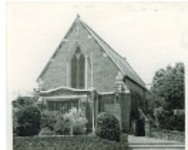
B1244 St Peter's Anglican Church