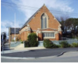
B1244 St Peter's Anglican Church