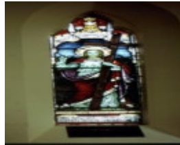
B1244 St Peter's Anglican Church