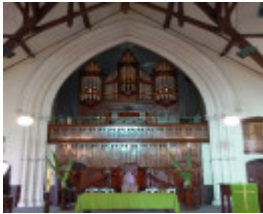
B4605 Fincham & Hobday Organ