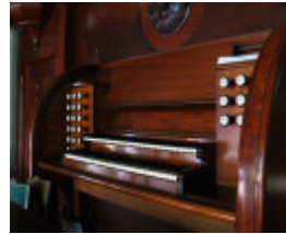
B4605 Fincham & Hobday Organ